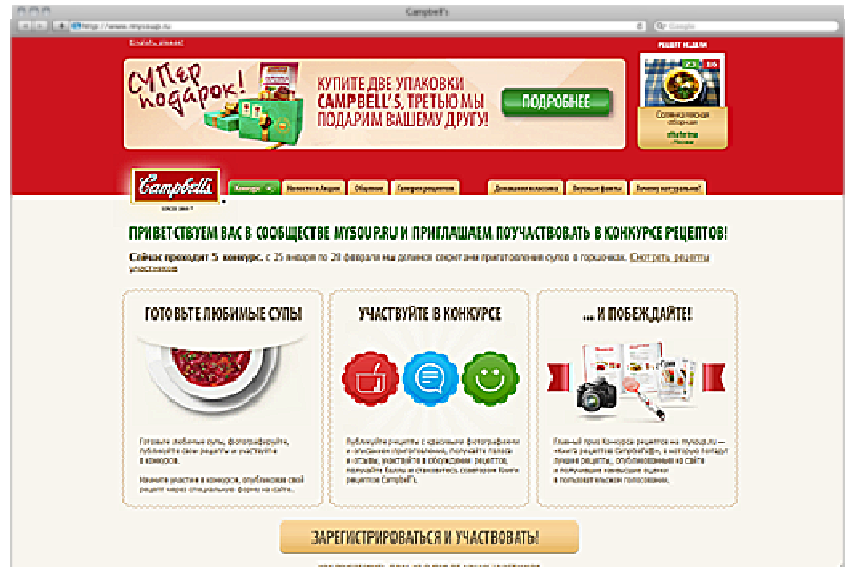
www.mysoup.ru main page

In the Products section, news feeds about the company and its products, along with important facts, an interactive diagram of the production process, information about upcoming promotions and other useful information are all available.