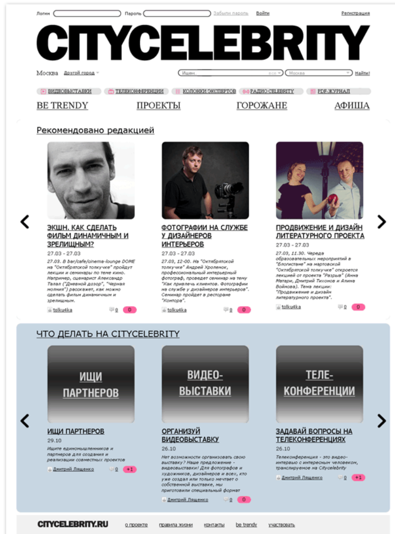
Elements and sections displayed on the Citycelebrity.Ru portal

Citycelebrity.ru is a portal which automatically generates for any city in Russia with a population of more than 300,000 people, with plans to move to the level of 100,000. The portal begins working as soon as the first user registers. All residents of Russia can become members by choosing the city nearest to them from the list.