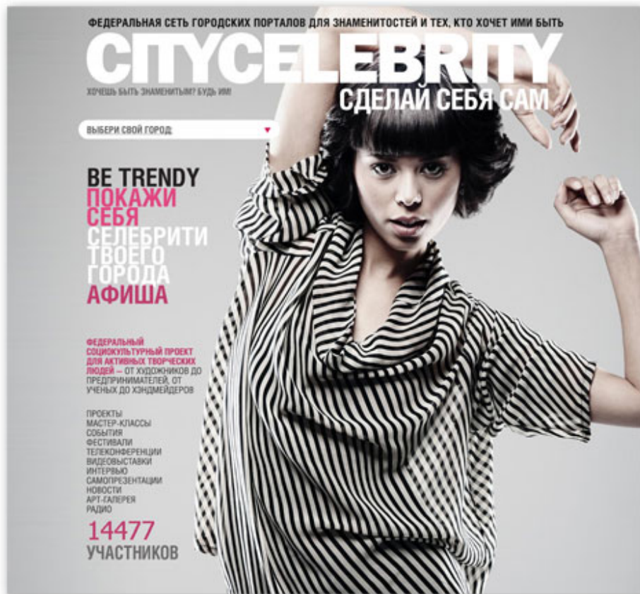
The main page of the Citycelebrity.Ru portal