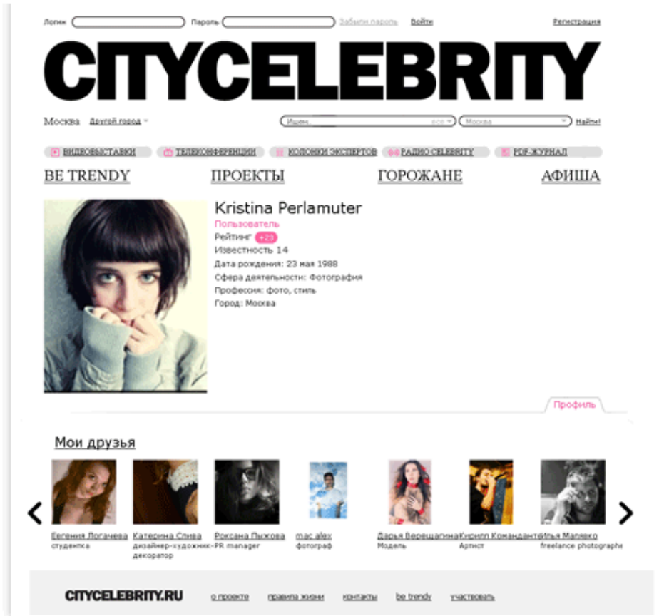
Personal User Page / User Profile at Citycelebrity.Ru